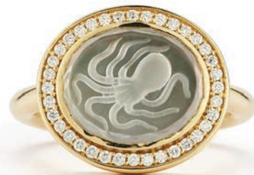
RENNA Small Octopus Caspian Ring with Grey Mother of Pearl and Diamonds