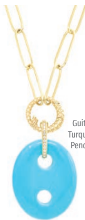
Guitam Turquoise Pendant