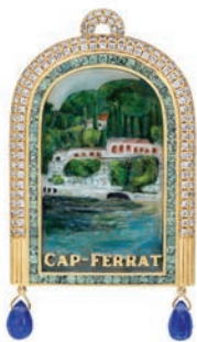
Maison Tjoeng Postcard Saint-Jean-Cap-Ferrat Pendant