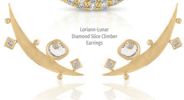
Loriann-Lunar Diamond Slice Climber Earrings