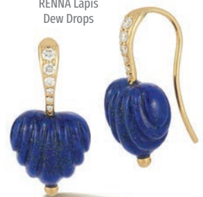
RENNA Lapis Dew Drops