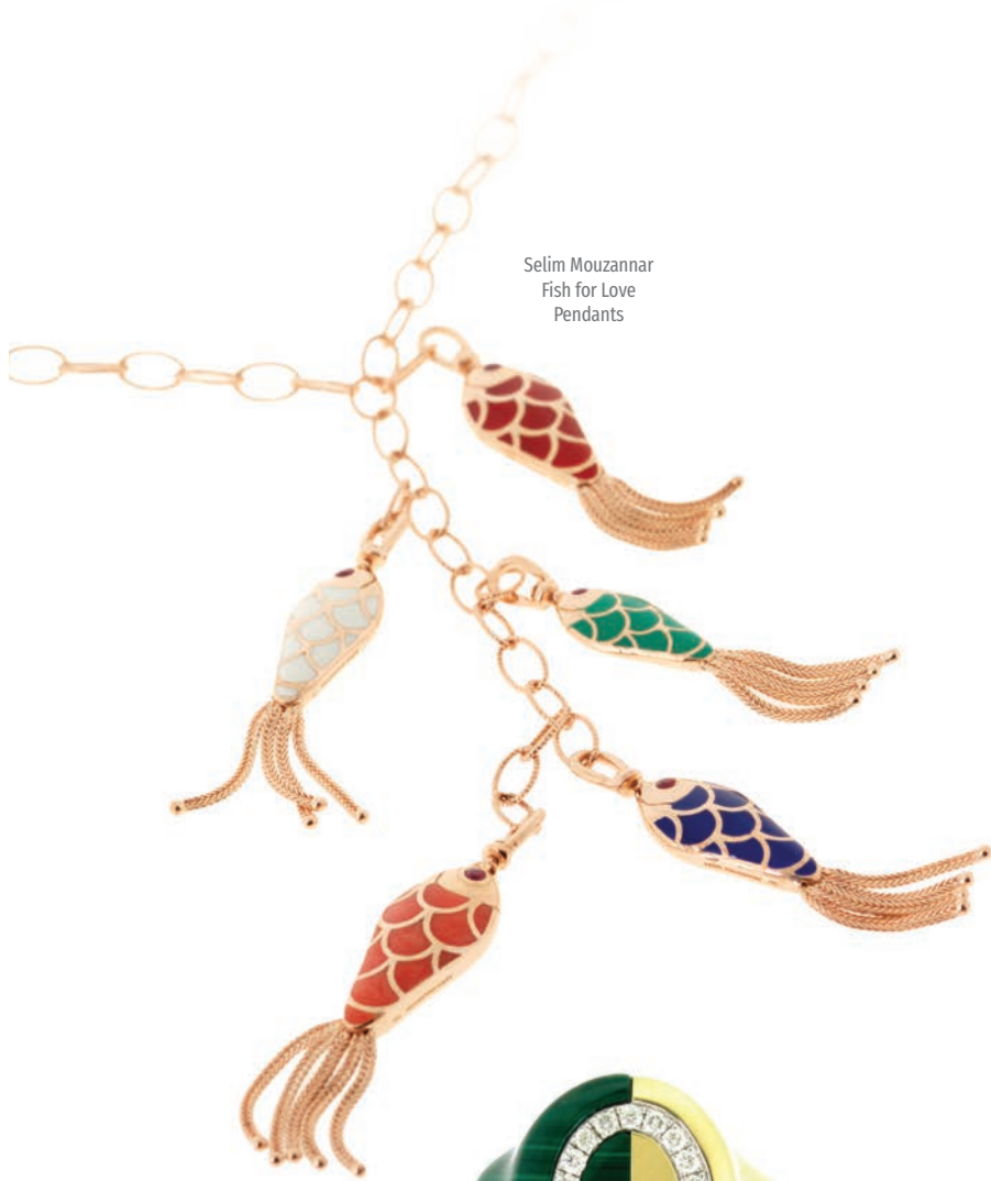
Selim Mouzannar Fish for Love Pendants