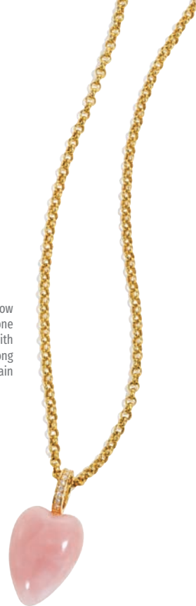
By Pariah 14ct Yellow Gold Heartstone Diamond Pendant with Pink Opal on Long Belcher Chain

captures a different area with a motto that expresses the feeling of what it was like or what it would be like to be there,” she adds.