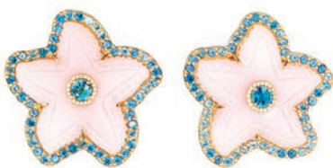
Guitam Starfish Studs