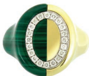
TYPE JEWELRY THE 6th Half & Half Malachite and Diamonds Signet ring

If you are an avid traveler, you will adore Maison Tjoeng’s Postcard collection, which features charms adorned with enamel, gems, and diamonds. While these depict Saint-Jean-Cap-Ferrat, Capri, Nantucket, and Honolulu, the Postage Stamp charms feature motifs reminiscent of the Amalfi coast, Hawaii, and Cape Cod. These charms serve as a sentimental touchstone to cherished memories and beloved locations around the world.