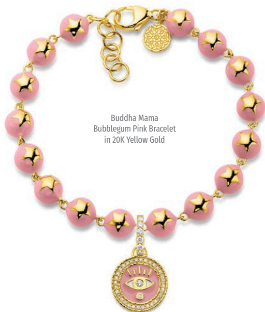
Buddha Mama Bubblegum Pink Bracelet in 20K Yellow Gold