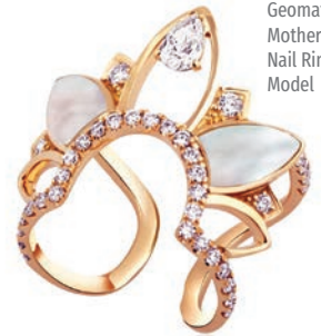
Bijouq Classic Geomatrix Mother of Pearl Nail Ring, L Model