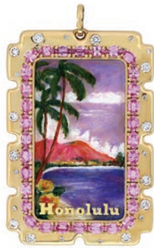
Maison Tjoeng Postcard Honolulu Pendant