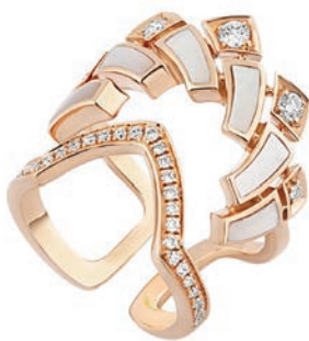
Bijouq Classic Geomatrix Mother of Pearl Nail Ring