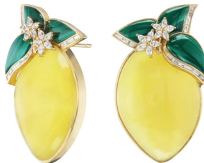
Sorellina Limoncello Earrings