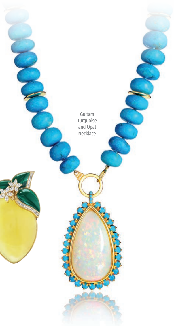
Guitam Turquoise and Opal Necklace