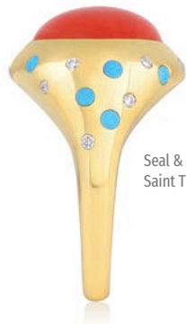
Seal & Scribe Saint Tropez Ring