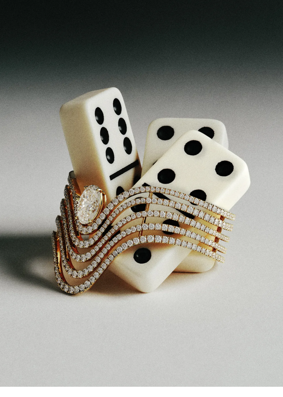
ASHKAL WAVE BRACELET IN GOLD WITH DIAMONDS, ASHKAL WAVE RING IN GOLD WITH DIAMONDS, TOKTAM

“WHAT'S YOUR NEXT MOVE?” IS PUBLISHED IN THE 17TH EDITION OF GRAZIA MIDDLE EAST. ORDER YOUR COPY HERE.